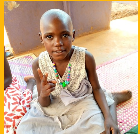
Showcasing a new flower necklace!